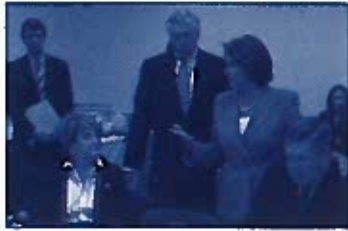
Congressional Representatives Louise Slaughter (D-NY), Steny Hoyer (D-MD), Nancy Pelosi (D-CA), and Norm Dicks (D-WA) meet with advocates on Arts Advocacy Day in March.

The Arts Action Fund monitors arts policy at the federal level and helps bring citizens' voices to the table when important arts issues are debated.