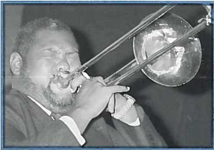
New Orleans has a rich history of jazz music, and many musicians are struggling to support themselves in the aftermath of Hurricane Katrina.

Following one of the worst natural disasters in our nation's history, Americans have responded with open hearts and open checkbooks. While immediate needs for food and shelter are the primary concern, art and music also play a vital role in lifting broken spirits and restoring lost hope.