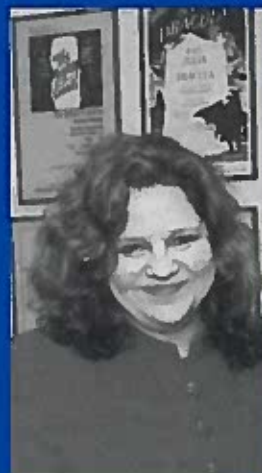
Wendy Wasserstein was an active member of the Artists Committee of Americans for the Arts Action Fund.