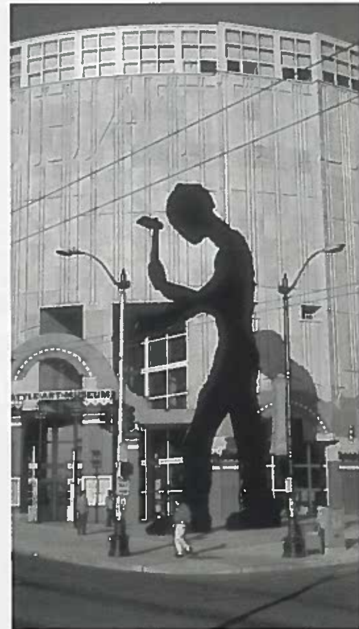
Hammering Man, 1991 Jonathan Borofsky Painted Cor-ten Steel