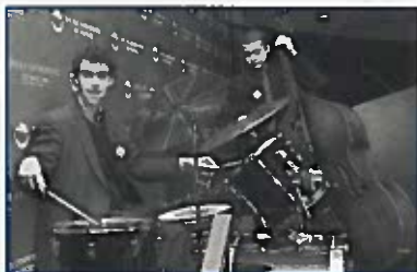
New Orleans music students traveled to Washington, DC, to perform at the Mayors Arts Luncheon, where Americans for the Arts and the U.S. Conference of Mayors presented the 2006 Public Leadership in the Arts Awards.

New Orleans Center for Creative Arts | Riverfront (NOCCA) received the 2006 National Award for Excellence in Arts Programs for Youth. As Louisiana's premier arts training center for high school students, NOCCA's alumni include such successful artists as Harry Connick, Jr. and the Marsalis