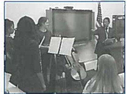
Americans for the Arts board member and acclaimed actor Giancarlo Esposito introduces members of the DC Youth Orchestra at the Congressional Arts in Education briefing on Capitol Hill.

Staff members representing 48 congressional offices attended the event. Shortly after this event, an exciting Guggenheim Museum study—funded by an arts education grant from the U.S. Department of Education—reported that students who participated in its Learning in the Arts program performed better in various categories of literacy and critical thinking.