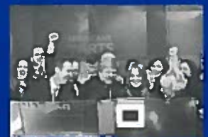
Americans for the Arts board members and staff join artist Jeff Koons in ringing the closing bell of NASDAQ on October 17, 2006.