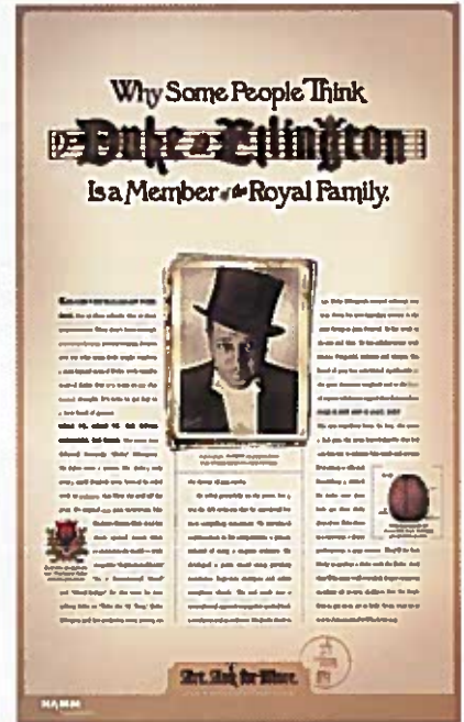
One of the print ads from Americans for the Arts and The Advertising Council's 2007 Public Service Campaign, Art. Ask For More.

Watch for the print ads to appear in major publications nationwide starting in early 2007, with television, radio, and billboard versions to follow.