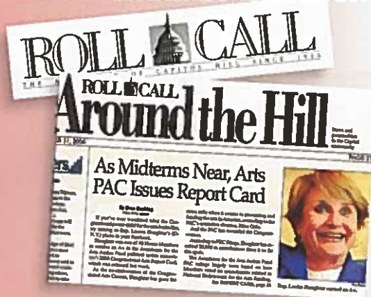
Major congressional newspaper, Roll Call, highlights Americans for the Arts Action Fund PAC's 2006 Congressional Arts Report Card.