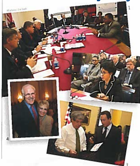
(1) Artistic Director of Jazz at Lincoln Center Wynton Marsalis testifies about the importance of arts education, cultural diplomacy, and disaster relief funding for cultural organizations.