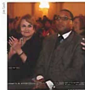
Keynote speaker and Artistic Director of Jazz at Lincoln Center Wynton Marsalis joins Rep. Louise Slaughter (D-NY) at the Congressional Arts Breakfast.

Wynton Marsalis, renowned musician and arts advocate, delivered a powerful keynote address. Marsalis highlighted the role art plays in communicating across epics and cultures, and told stories about the many music students and teachers he