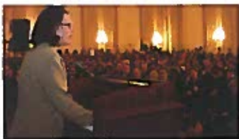
Rep. Betty McCollum (D-MN) addresses 450 arts advocates on Capitol Hill as she accepts the 2007 Congressional Arts Leadership Award.

We know that stronger grassroots arts advocacy leads to more government support for the arts. The positive climate in the current Congress is a perfect example. The positive trend is evident in the growing number of representatives and senators who have joined their respective arts and cultural caucuses. To date, there are 33 members of the Senate Cultural Caucus and 151 members of the Congressional Arts Caucus.