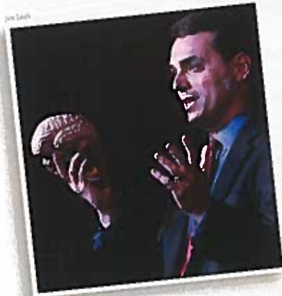
During Americans for the Arts' 21st annual Nancy Hanks Lecture on Arts and Public Policy, author Dan Pink made a persuasive case linking arts education to the kind of brain development needed to build creative and innovative thinking skills for 21st-century jobs.

You can read more about these honorees and the other awards presented to outstanding arts leaders at www.AmericansForTheArts.org/news/press/2008/2008_07_18.asp .