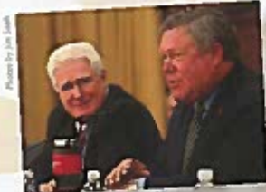
Chairman of the House Subcommittee on Interior Appropriations Norm Dicks (D-WA) and Rep. Jim Moran (D-VA) addressing witnesses at the congressional hearing on arts funding organized by Americans for the Arts.