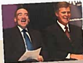
Gov. Mike Huckabee (R-AR) and Rep. Richard Tiahrt (R-KS) were featured speakers on the arts panel hosted by Americans for the Arts and NAMM at the Republican National Convention.