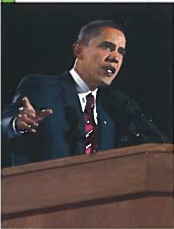
President-Elect Barack Obama on election night at Grant Park in Chicago.