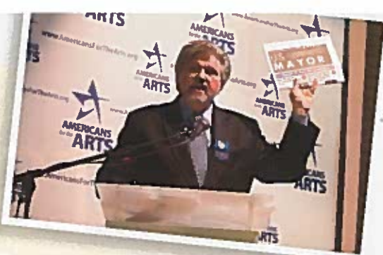
Americans for the Arts Action Fund President and CEO Robert L. Lynch praises The United States Conference of Mayors for including support for the arts and the appointment of a senior-level arts policy position at the White House within its 10-point plan for a better America.

None of this good news happened by accident or by luck. It happened