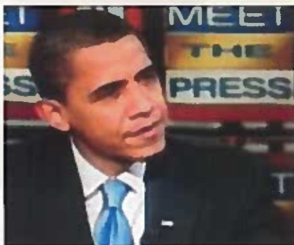
In his first Sunday morning television appearance after the election, President-Elect Obama discussed his intention to promote arts and culture through the White House.

Before his inauguration, President Obama spoke to Tom Brokaw on Meet the Press on December 7, 2008. Among the important policies then President-Elect Obama outlined was his intention to promote arts and culture through the White House. President Obama said he was, "thinking about the diversity of our culture and inviting jazz musicians and classical musicians and poetry readings to the White House, so that, once again, we appreciate this incredible tapestry that's America." After his appearance, Obama's Economic