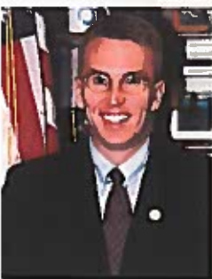
Rep. Todd Platts (R-PA) will serve as the new Co-Chair of the Congressional Arts Caucus.