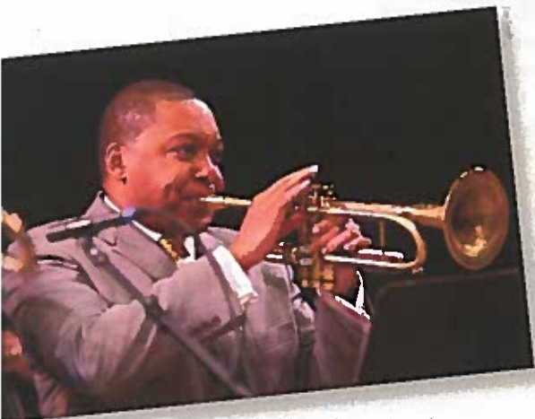
Wynton Marsalis delivers the Americans for the Arts 22nd Annual Nancy Hanks Lecture on Arts and Public Policy.

In the days immediately after the event, more than 8,000 visitors watched the lecture on the Internet, where you can still listen to Marsalis's inspiring message at www.AmericansForTheArts.org/Hanks .