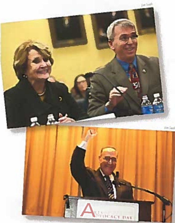
(Top) Bipartisan Co-Chairs of the Congressional Arts Caucus Rep. Louise Slaughter (D-NY) and Rep. Todd Platts (R-PA) spoke at the Congressional Arts Breakfast before delivering testimony at the Third Annual Congressional Hearing on the Arts.