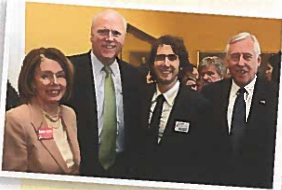
Singer/songwriter Josh Groban joined us on Arts Advocacy Day and took extra time to help us raise money for the Arts Action Fund PAC. Groban is a great artist who proved to be a great arts advocate as well. He's pictured here with House Speaker Nancy Pelosi (D-CA), Rep. Joseph Crowley (D-NY), and House Majority Leader Steny Hoyer (D-MD) at the Democratic Arts Leadership Luncheon.