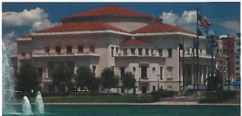
The high-tech Palladium Performing Arts Center is the latest proof that the City of Carmel is dedicated to economic expansion through arts-based infrastructure.

Americans for the Arts and The U.S. Conference of Mayors presented James Brainard with the 2011 Public Leadership in the Arts Award for Local Arts Leadership for his steadfast efforts in promoting the creative economy in Carmel.