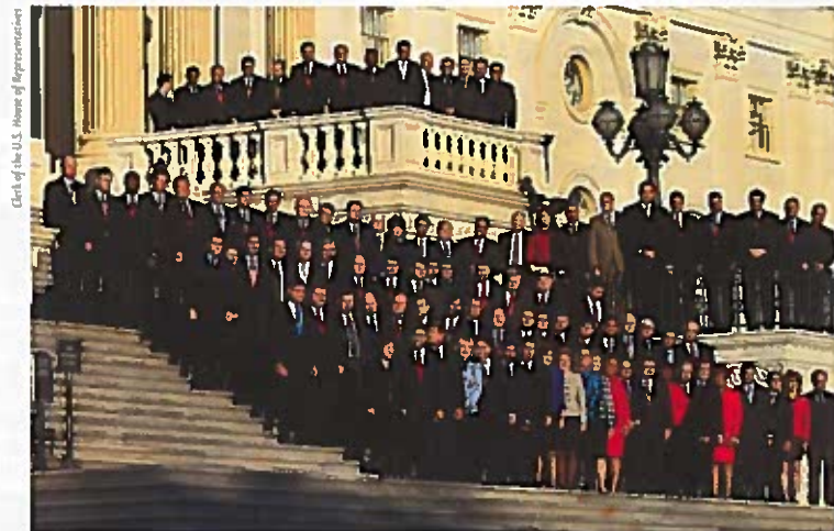
Freshman members of the 112th Congress are sworn in on January 5, 2011.

We urge all members of the Americans for the Arts Action Fund and their networks to contact their representatives in the House to support the arts and arts education and to join the Congressional Arts Caucus. For a list of current caucus members and how to contact your representatives, please see page 2.