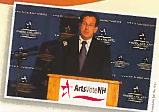
Connecticut Gov. Dan Malloy speaks at a New Hampshire ArtsVote event in 2008 to bring the arts to the forefront of the presidential race. Join us as we gear up for ArtsVote2012.